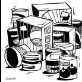
Table of Plenty—Lenten Food Drive

Our annual Table of Plenty food drive for St. Therese Center will start on Ash Wednesday. Bring a can of food with you when you come to Mass. We would like to involve the whole campus – the various departments, the Greek