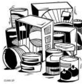
Table of Plenty—Lenten Food Drive

Our annual Table of Plenty food drive for St. Therese Center will start on Ash Wednesday. Bring a can of food with you when you come to Mass. We would like to involve the whole campus – the